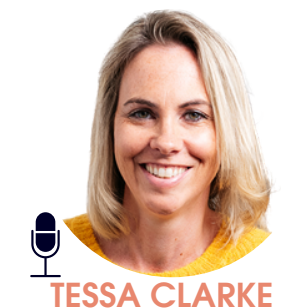
Co-Founder & CEO of OLIO, a free app tackling the problem of food waste, UK