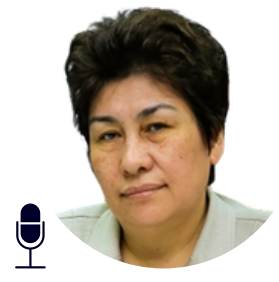
KULYASH SHAMSHIDINOVA Chair of Nazarbayev Intellectual schools, former Minister of education and science of Kazakhstan